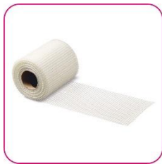
Glass fibre tape