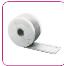
or Sealing tape in the wet area